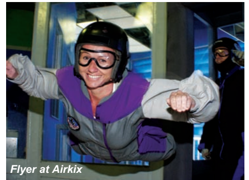
Flyer at Airkix

and park nights for the seasoned pros. Or, if you don't fancy keeping your feet on the ground, why not check out the indoor skydiving tunnel - Airkix - where the basic package gives you the equivalent of two complete real skydives! Plus, you can stay sky high by visiting the two indoor rock climbing walls. The great leisure offerings don't stop there either, with a 24 lane ten pin bowling alley and a luxury 16 screen cinema, you're really spoilt for choice!