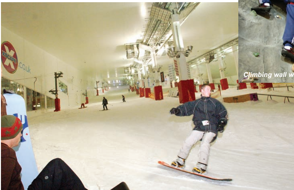
Snowboarder with Crowd

Looking for a bit of action after dark? Oceana - the region's leading nightclub - is in Xscape, and offers 6 different rooms, all with a completely unique sound as well as Jongleurs Comedy Club, and a two-for-one cocktail bar. As well as that, there are a number of pubs and bars all ready to kick your evening off with a bang.